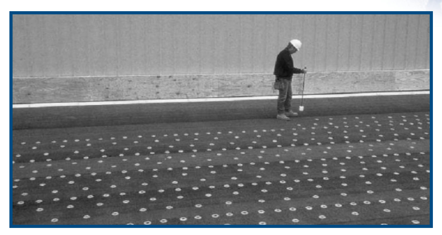
Nailing the base sheet to a lightweight insulating concrete deck.