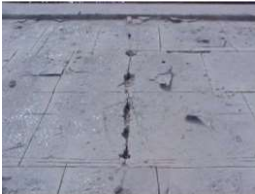
4. Deteriorated Gypsum Deck