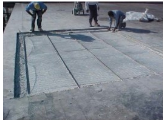
11. Completed Installation of New Wire Mesh