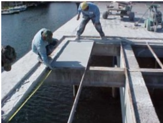
8. Installing New Form Board in Repair Area