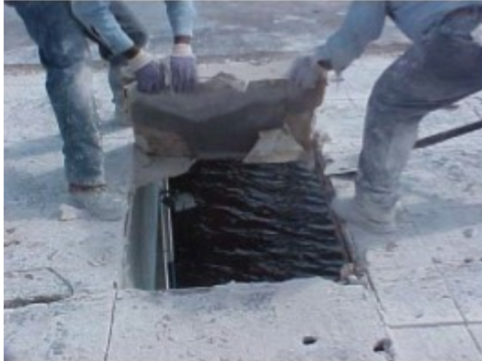
6. Removing Cut Section