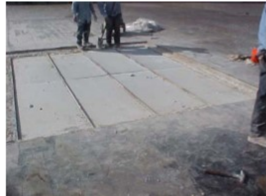
9. Complete Installation of New Form Board