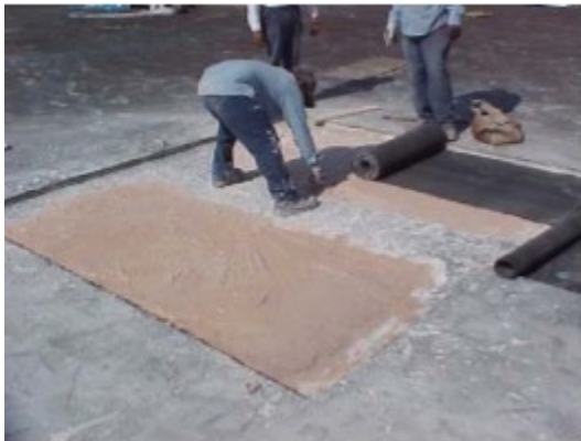
13. Rolling Out New Base Sheet