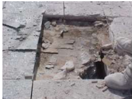
5. Cutting Section from Deck