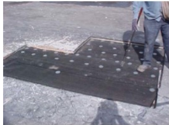
14. Fastening New Base Sheet to Gypsum Concrete After Concrete Is Set