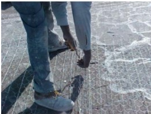
10. Installation of Ties to Connect Old Wire Mesh to New Wire Mesh Around Perimeter of Repair Area