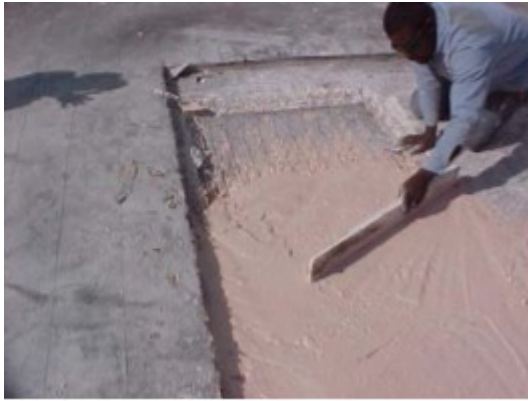
12. Installing New Gypsum Concrete and Smoothing Surface