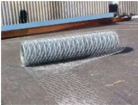
3. Galvanized Wire Mesh