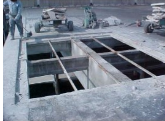
7. Section of Deck Removed Back to Structural Elements