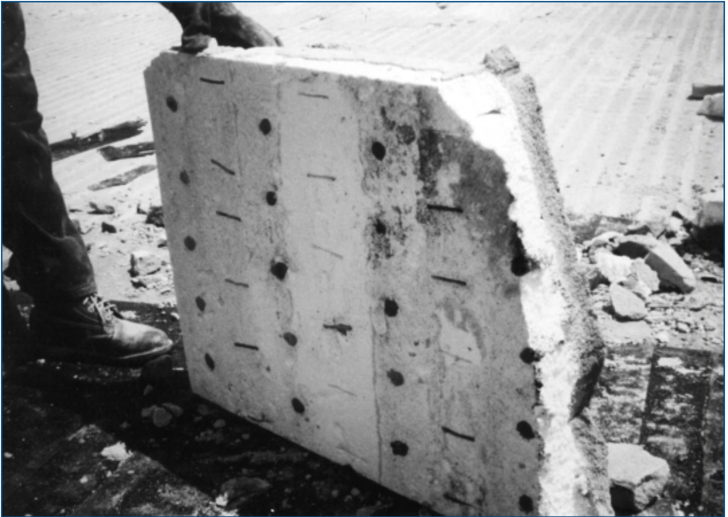
Aggregate-based material with inadequate bond at slurry coat.